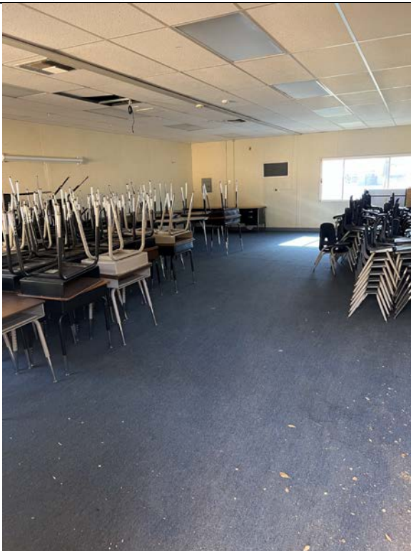
Lot 2 (RM E17)