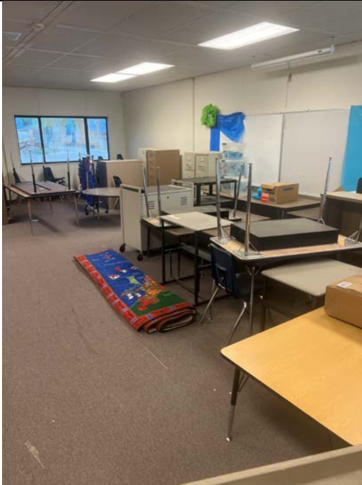
Lot 6 (E25)