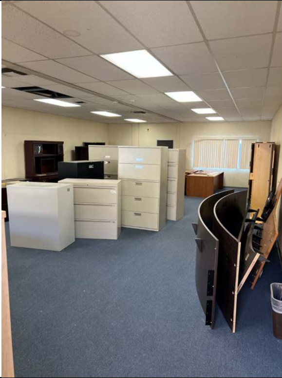
Lot 1 (RM E15)