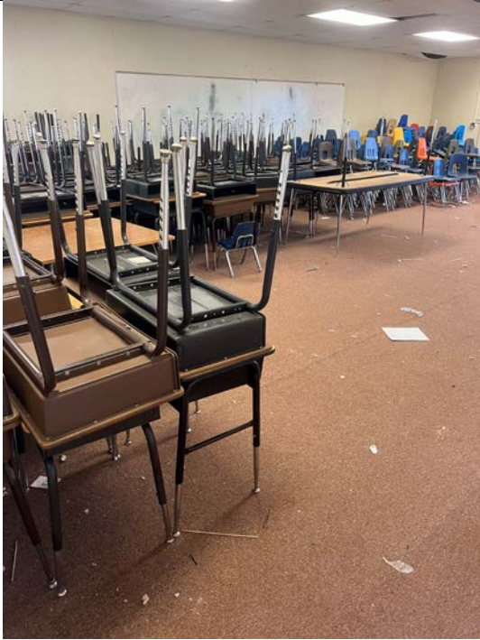
Lot 3 (RM E20)