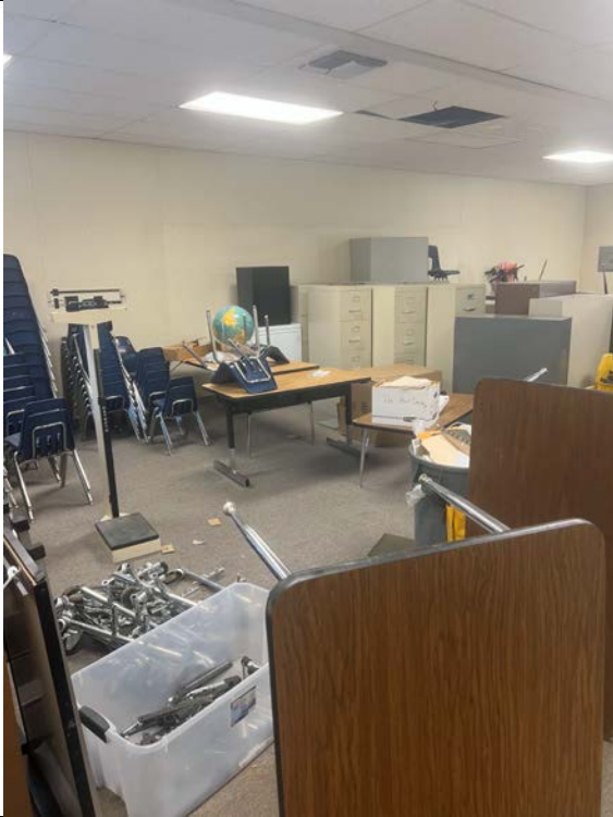
Lot 5 (E12)